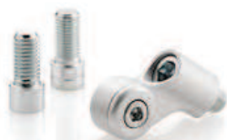
BS711B - BS714 - BS715